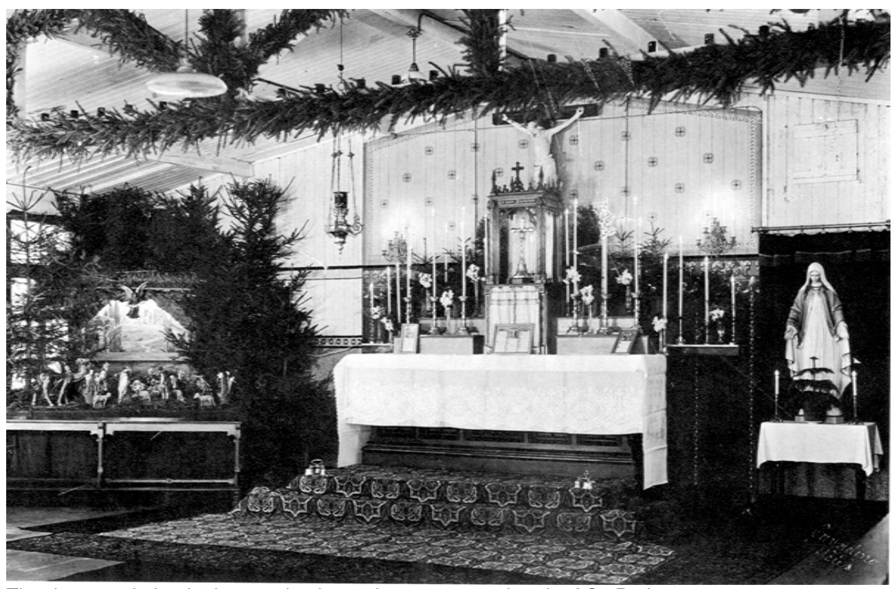
The decorated altar in the wooden barrack emergency church of St. Barbara, 1933