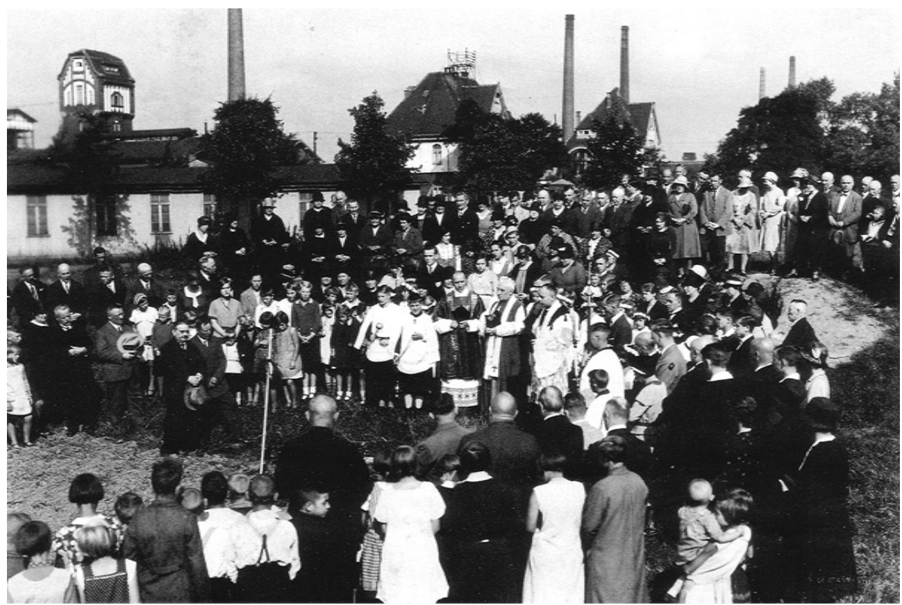
Groundbreaking ceremony for the construction of the 'Barbarakirche' on 25 August 1932