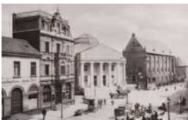
Market with museum and Zeughaus, about 1912