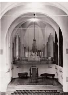
View of the Zeughaus when used as a concert hall with the organ installed in 1951