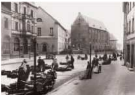
Market with sales hall and Zeughaus, about 1910